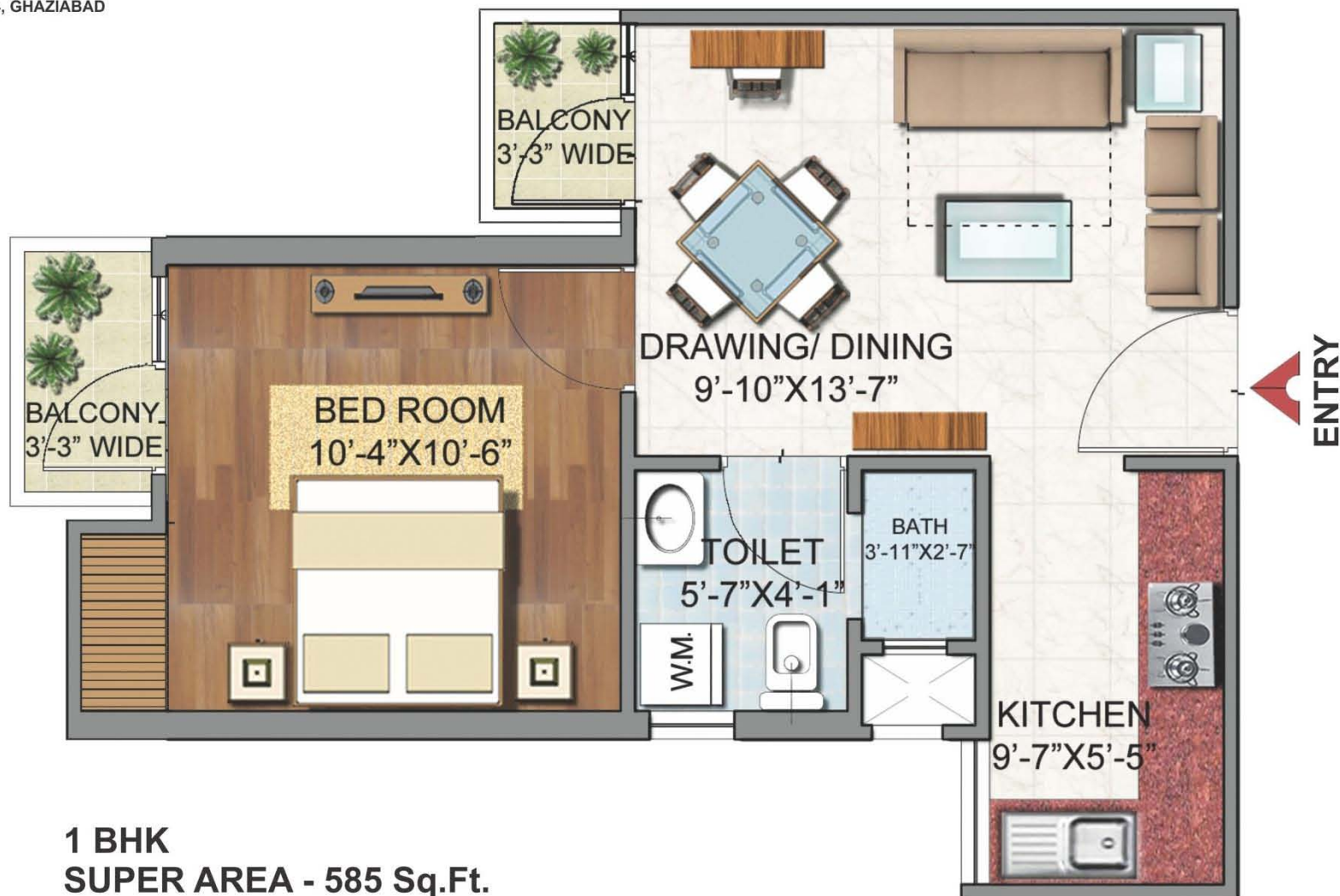
1 BHK SUPER AREA - 585 Sq.Ft.